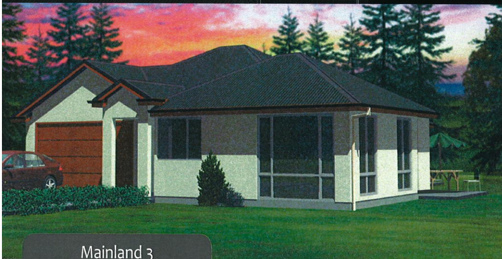
Mainland 3 Lot 4 Karaka Ridge, Karaka