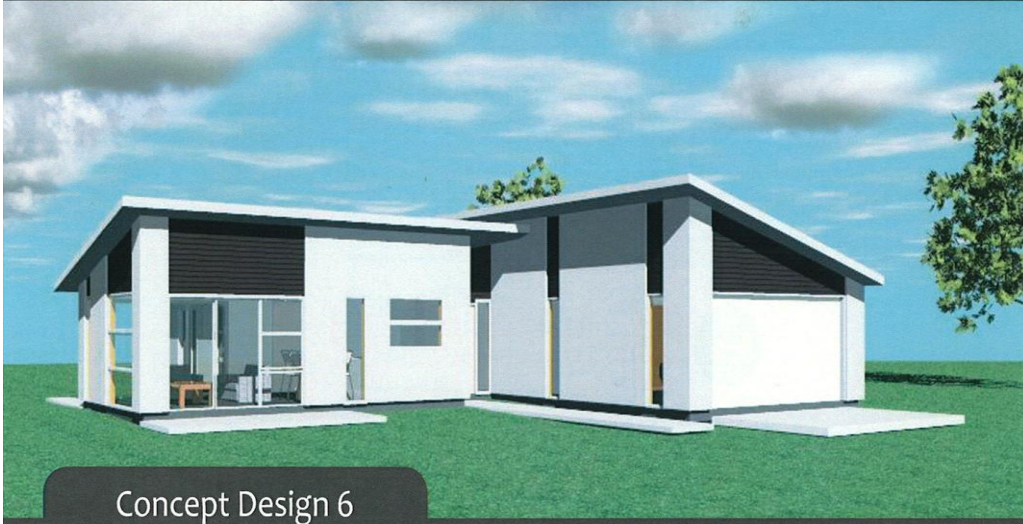
Concept Design 6 Lot 28, Abby Close, Pukekohe